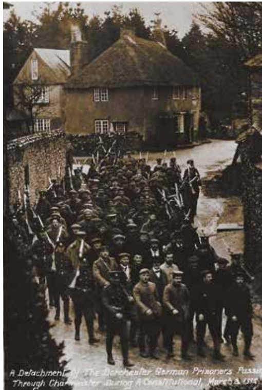
A Detachment of The Dorchester German Prisoners Passing Through Charminster During A Constitutional, March 1915.